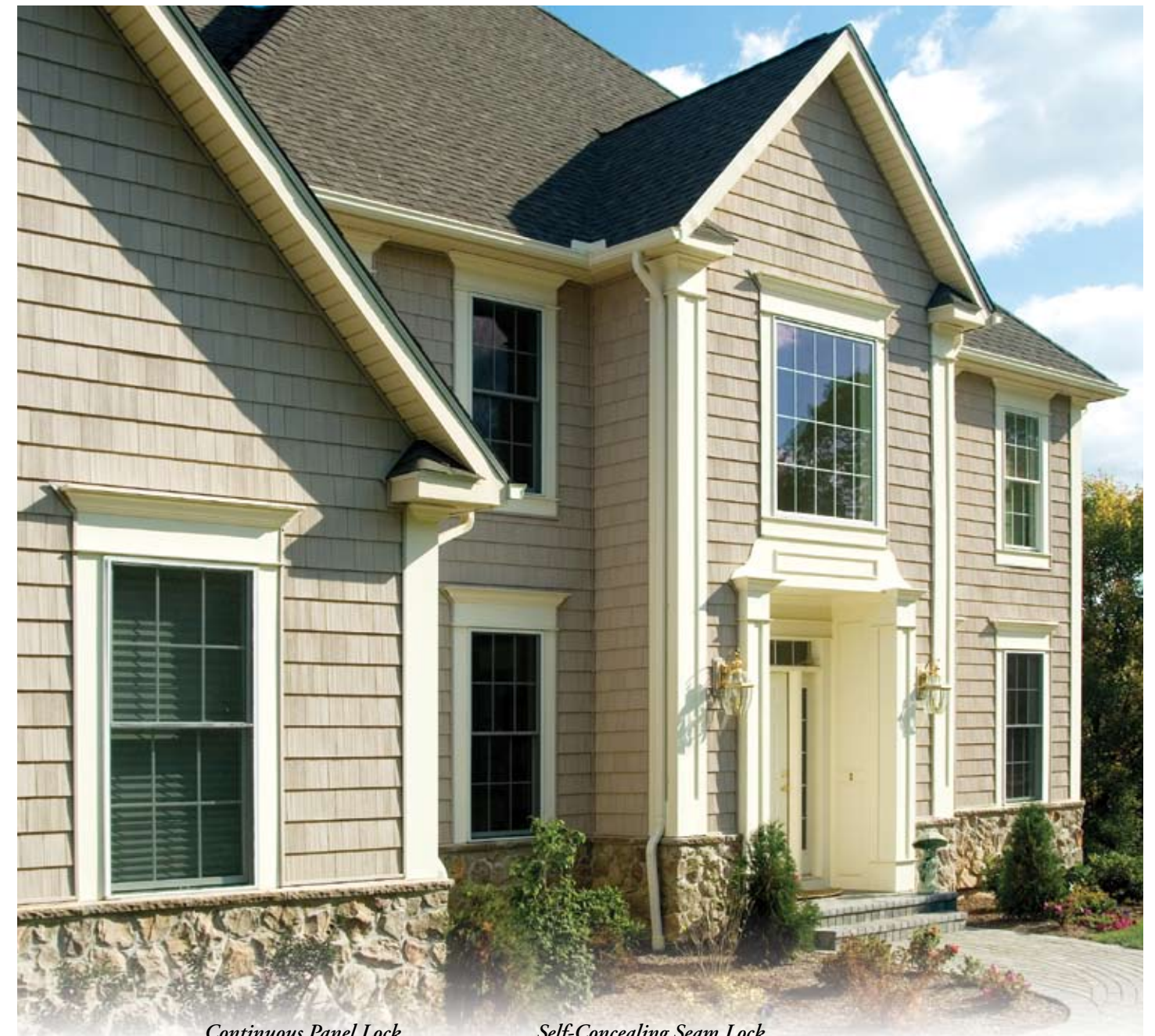
Continuous Panel Lock

Our shakes and scallops are designed and manufactured to perform under extreme weather conditions. In independent lab tests, Pelican Bay One remained secure in Category 5 hurricane-velocity winds.