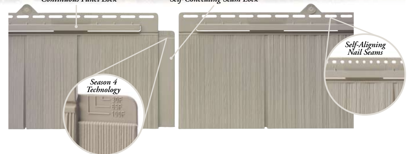
Self-Concealing Seam Lock